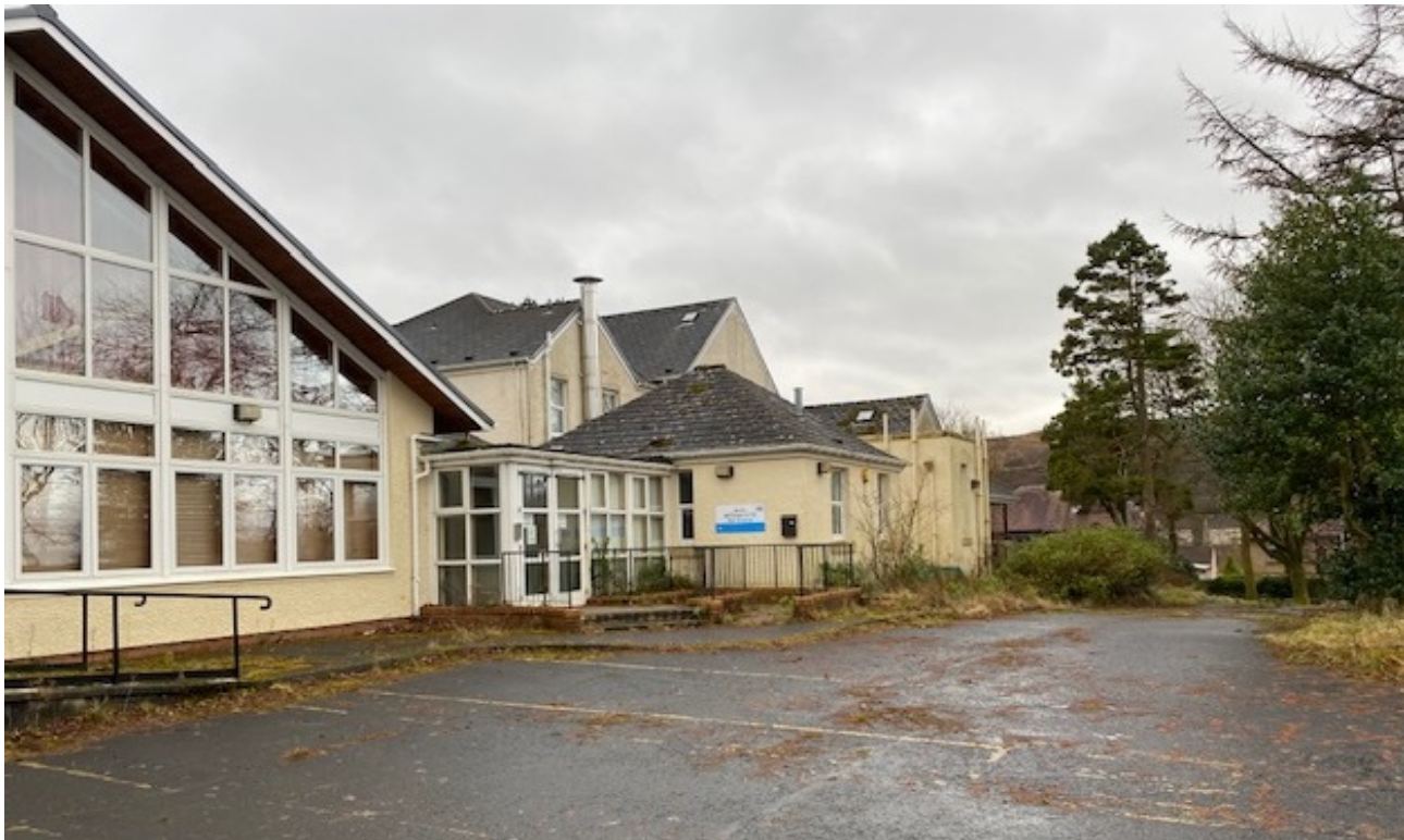
The McPherson Drive elevation of the premises

Considering ecology, I note that the site has no natural heritage or landscape designations. For non-designated sites Policy 33 of both the adopted and proposed Local Development Plans indicate that the siting and design of development should minimise adverse impacts on wildlife as well as being designed to conserve and enhance biodiversity. I also note the concerns raised regarding the impact on ecology within the site. The applicant has undertaken a bat survey in support of the proposal. The building is identified as having a low to moderate bat roosting potential and whilst bat activity was recorded around the building, no wall touching or approaches into the building were observed. The trees and associated features have also been assessed as being of negligible to low suitability for roosting bats. The applicant therefore considers that, in accordance with the Bat Conservation Trust good practice guidelines, no additional investigation is required for trees prior to felling. The Council's ecology advisor noted some minor concerns but concluded that that the desktop survey provided an appropriate level of background information; the dusk emergence and dawn surveys were carried out at a suitable time of the year, however due to Covid Restrictions, it was recognised that the number of visits was cut short; the daytime site inspection was equivalent to the BSPE "Preliminary Roost Assessment (PRA) survey"; the surveyors were suitably experienced in bat survey work and