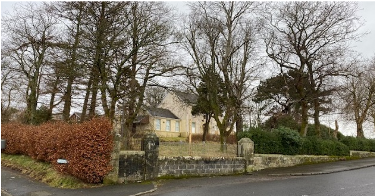
The site as viewed from Tower Drive

Successful residential layouts require well designed buildings in a setting of gardens and open space and within a framework established by landscape features and road layout, all recognising the impact on neighbours. The site is located in the existing urban area and in the surrounding area there are a variety of house types. These houses are generally developed in distinct blocks of similarly designed